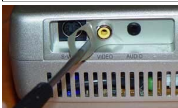
Figure 4: Once the sticker is removed the USB connector will be visible