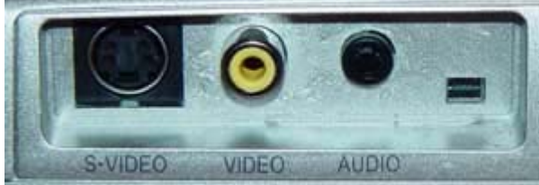
Figure 5: The USB connector to the right of the audio connector is used to control this projector