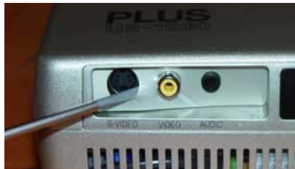
Figure 2: Use a Flat head screwdriver to help pry the sticker off