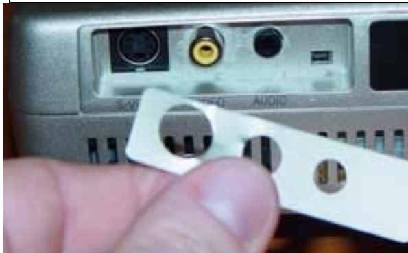
Figure 3: Continue removing the sticker until it is completely removed