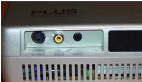
Figure 1: This is the back of the PLUS projector before removing the sticker